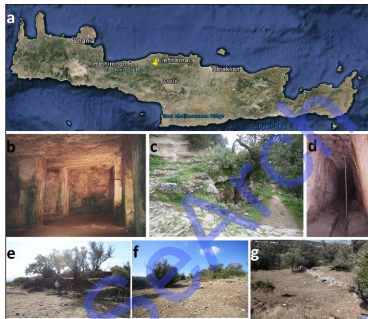
Figure 1: a) Google Earth satellite image of Crete with the location of Eleutherna; b, c) View of the interior and the entrance of cistern 1; d) The roman aqueduct tunnel as it is seen from its entrance; e, f, g) Views of “Anemomylos” site where the ERT survey was conducted from north, south and east.

Geophysical methods can provide a non-invasive alternative within the archaeological research in mapping buried structures related to ancient water infrastructures. Bavusi et al (2004) reported a multidisciplinary geophysical approach with gradiometry, HVSr (Horizontal to Vertical Spectral Ratio) and GPS techniques to map a Roman aqueduct. An effort was made by Brinon and